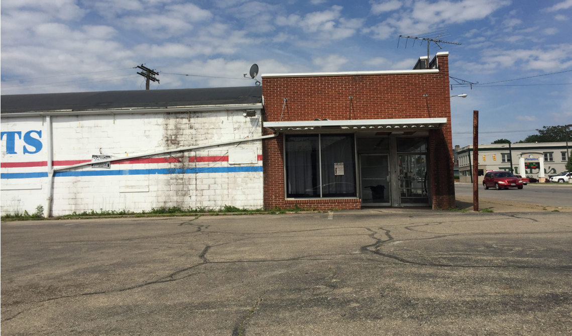
SIDE ENTRANCE / PARKING LOT