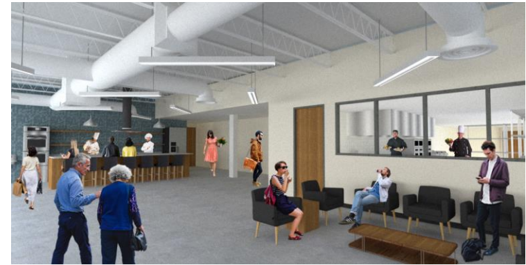
Rendering depicting common area of The Kitchen Collective