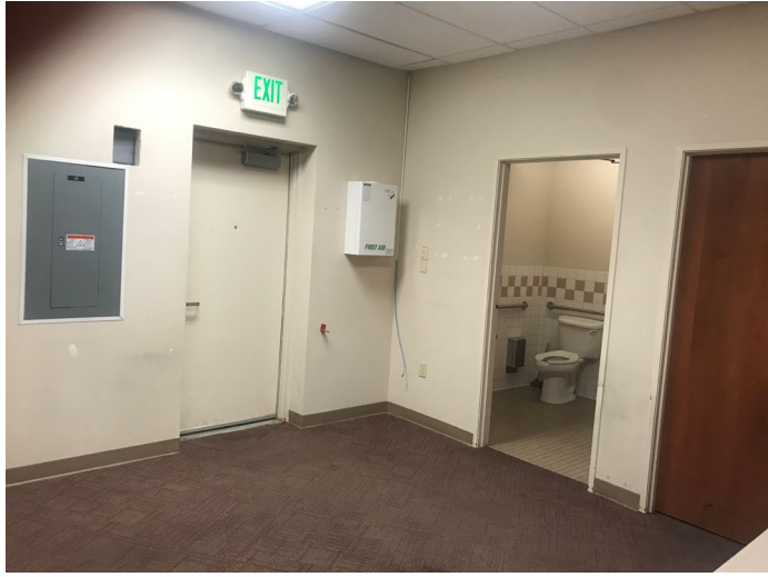
6 Pine Cone Road, Unit 6