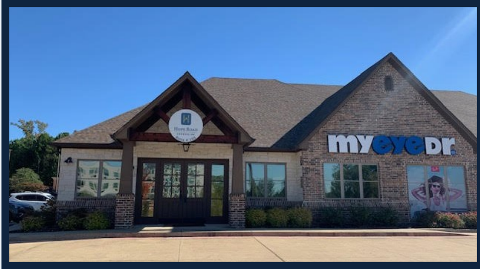
Front Entry for Suite 101