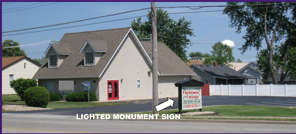
LIGHTED MONUMENT SIGN