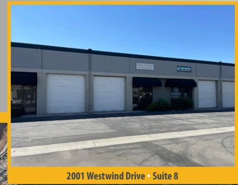
2001 Westwind Drive - Suite 8

2001 Westwind Drive ▪ Suite 8 ▪ Bakersfield, CA