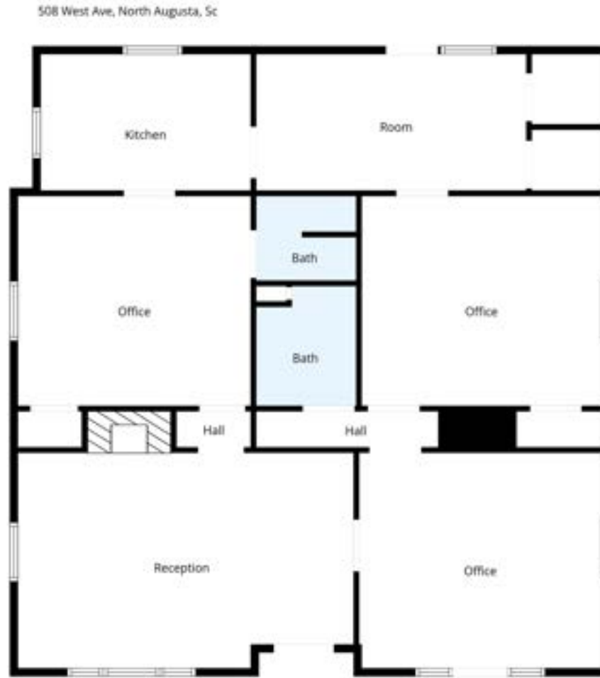
Floor Plan Created By Cubicase App. Measurements Deemed Highly Reliable But Not Guaranteed.