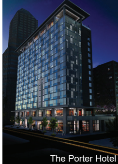
The Porter Hotel