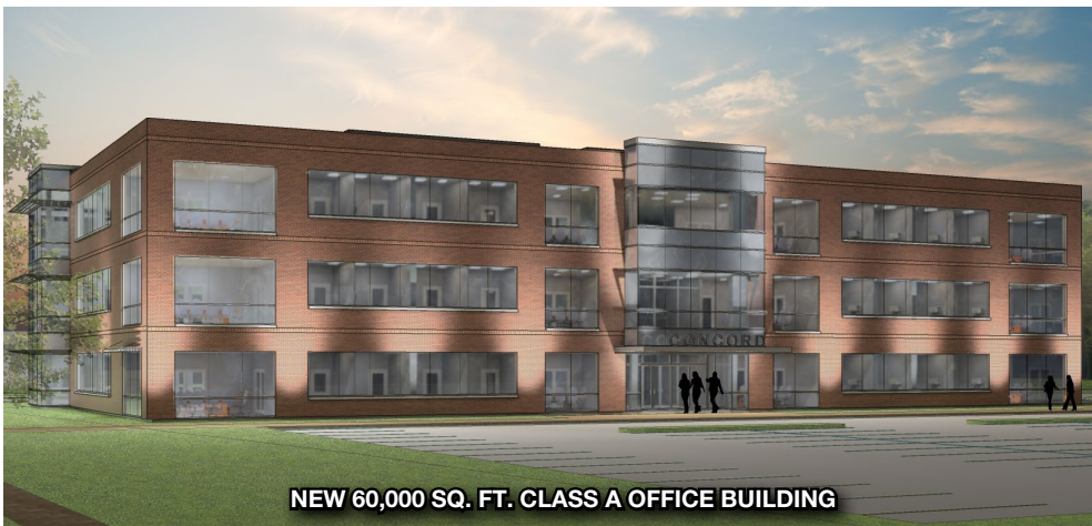
NEW 60,000 SQ. FT. CLASS A OFFICE BUILDING