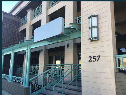
Building signage on highly trafficked Main St. (Lake Cook)

JACOB ISAACSON 847-277-9367 jacob@gkdevelopment.com