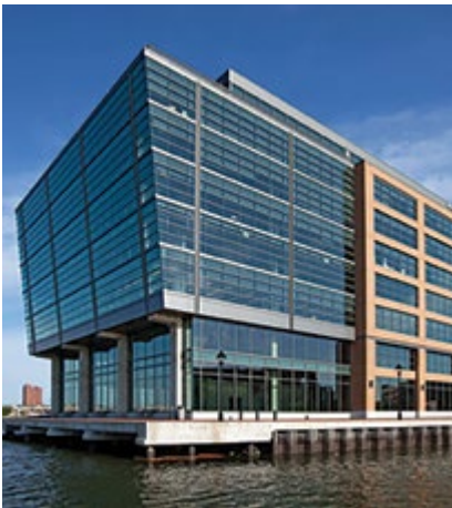
Thames Street Wharf Baltimore, Maryland