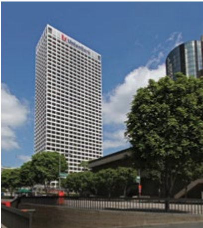
Union Bank Plaza Los Angeles, California