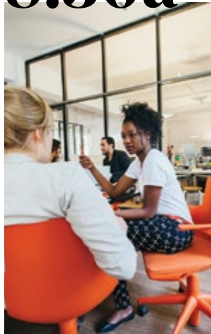
HIGHLAND PARK PLACE The new on-site conference center is ideal for hosting the quintessential client meeting.