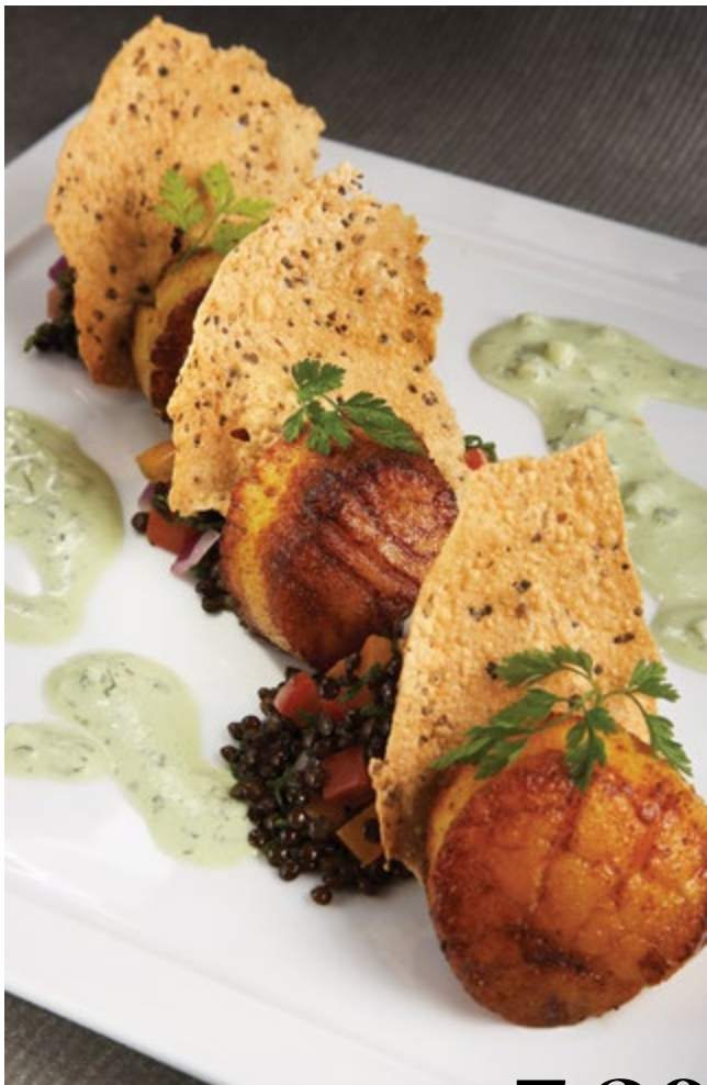
DINNER AT ABACUS Located adjacent to Highland Park Place and rated one of the top 20 restaurants in the city, Abacus is the perfect place to enjoy Dallas' finest gourmet cuisine at the end of the day.