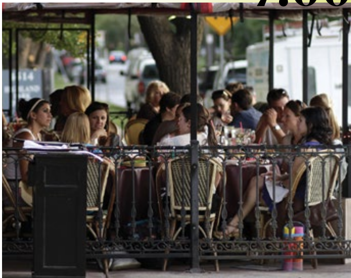
COCKTAILS AT SANGRIA Wind down from the workday with a cocktail on Sangria's patio.