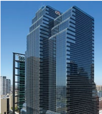
500 West Madison Chicago, Illinois