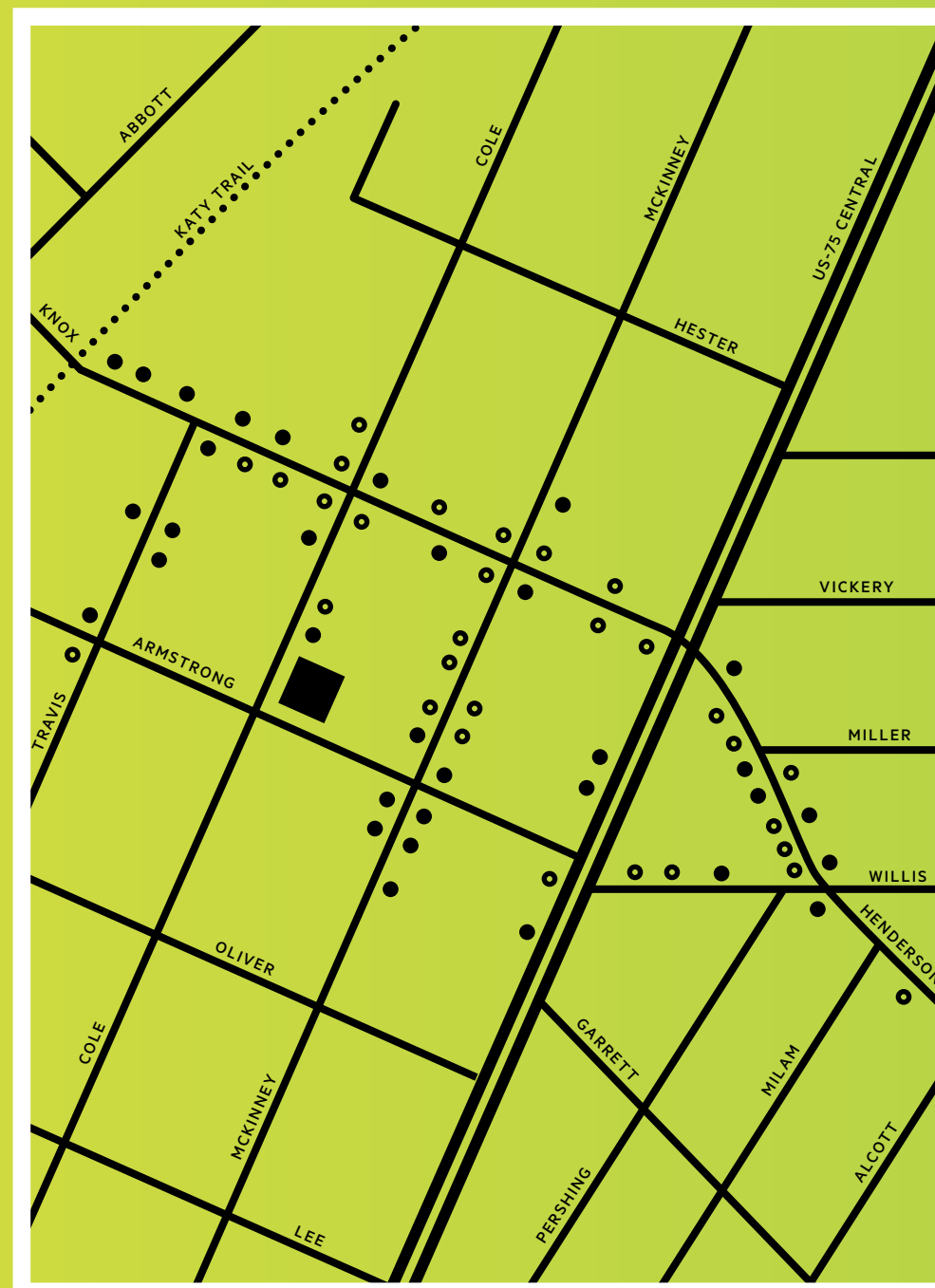
Knox Henderson Area Map

■ HIGHLAND PARK PLACE ○ SHOPPING ● BARS AND RESTAURANTS