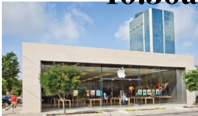
THE APPLE STORE When you need hands-on tech support, the Apple store's Genius Bar is just around the corner.