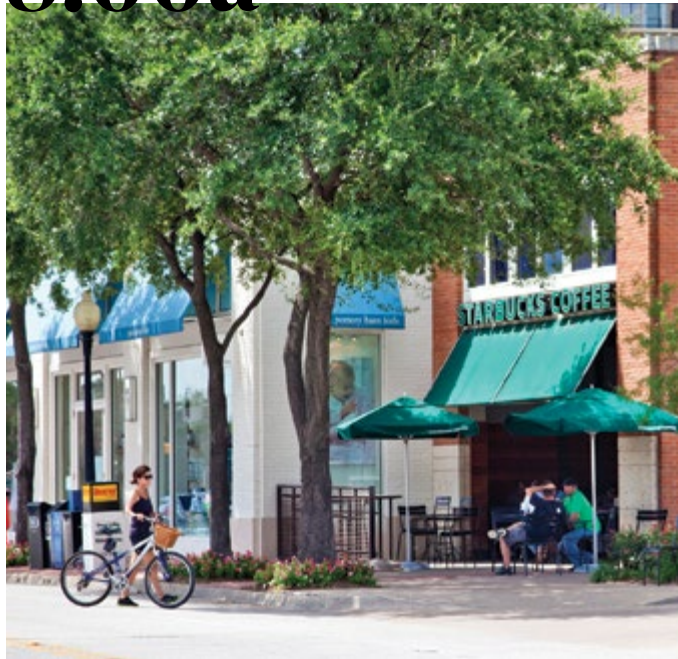
COFFEE AT STARBUCKS Right around the corner from Highland Park Place, Starbucks is conveniently located so you can grab your morning cup on the way into work.