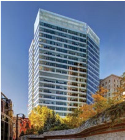
222 Main Salt Lake City, Utah

We know it’s not only where you do business that matters, but how you do business. Our “hands-on” approach has led us to many successes, gaining us profound trust with our clients. At KBS, we believe our people are our greatest asset and our tireless efforts to conduct good business has not only earned us repeat investment opportunities, but also formed long lasting relationships.