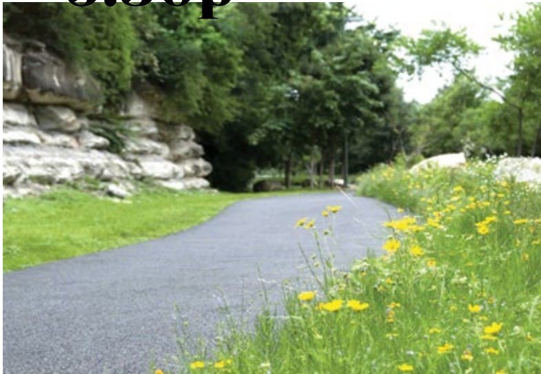
JOG ON THE KATY TRAIL Highland Park Place is only 3 blocks from the Katy Trail, giving tenants access to the extensive trail network.