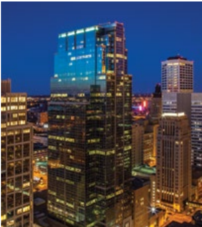
RBC Plaza Minneapolis, Minnesota