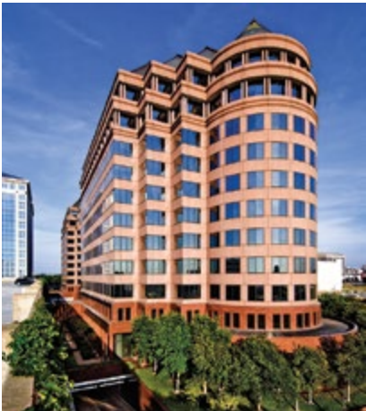
Providence Towers Dallas, Texas