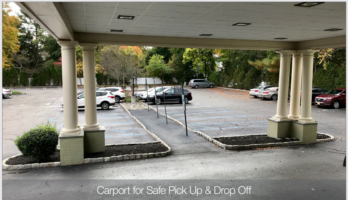
Carport for Safe Pick Up & Drop Off