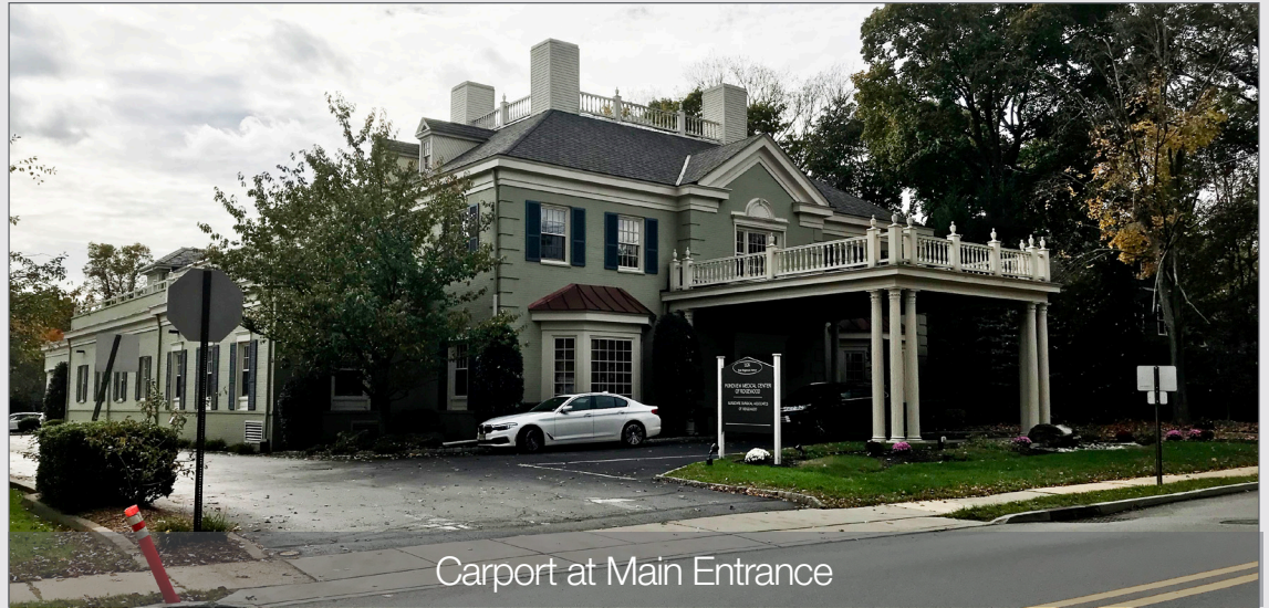
Carport at Main Entrance