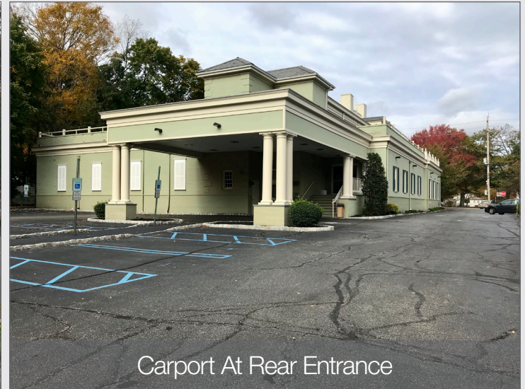
Carport At Rear Entrance