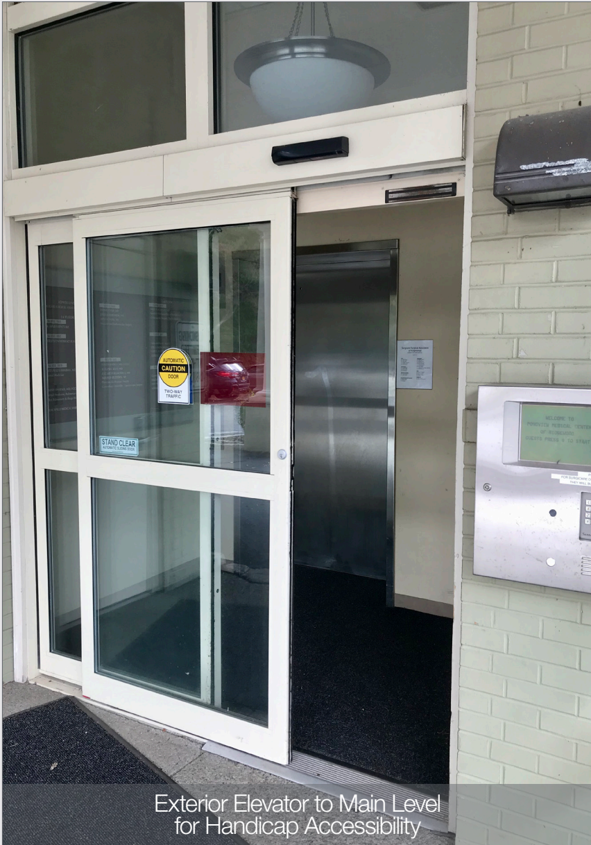
Exterior Elevator to Main Level for Handicap Accessibility