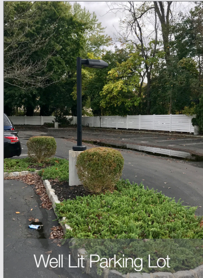
Well Lit Parking Lot