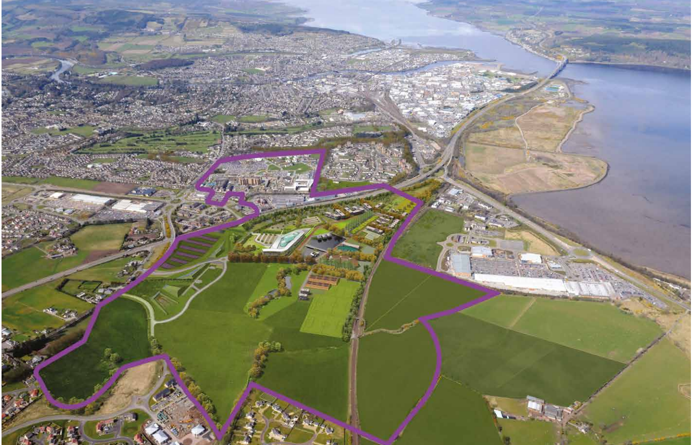
Aerial view - Wider Inverness Campus and city, 7N Architects