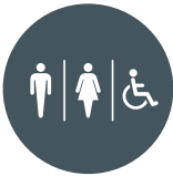
MALE, FEMALE & DISABLED WC'S