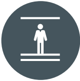
FULL ACCESS RAISED FLOORS