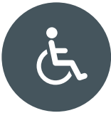
FULLY DDA COMPLIANT