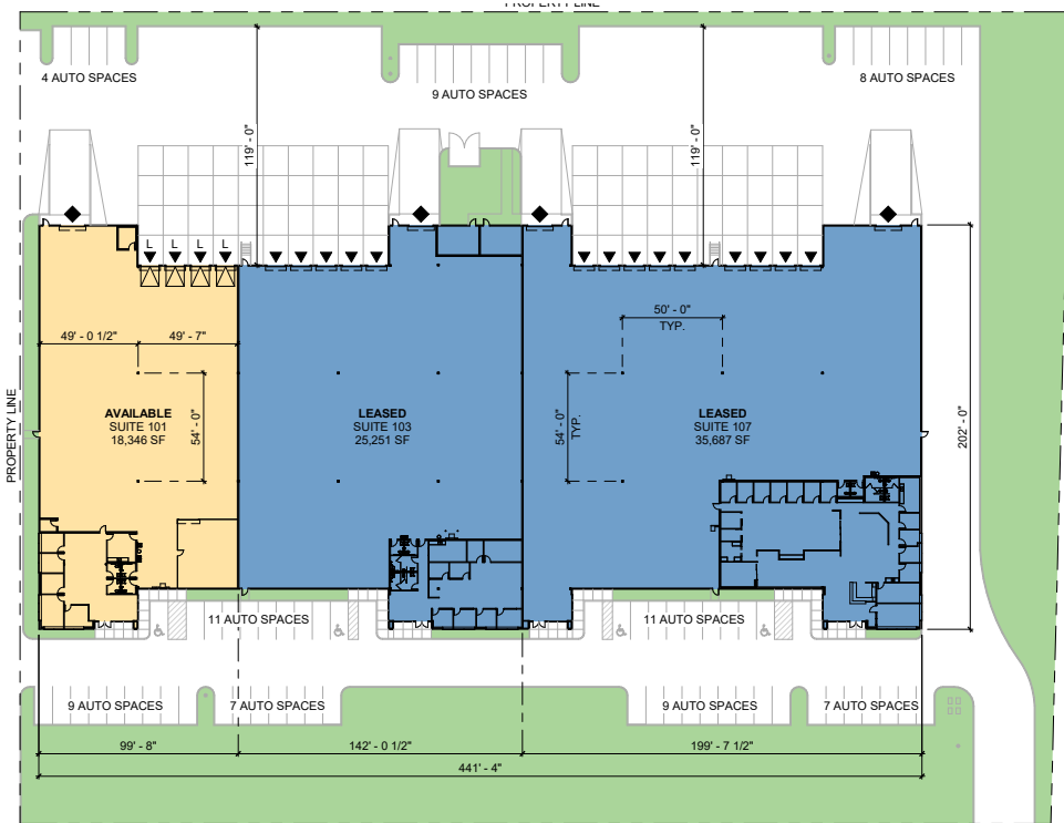
OVERALL SITE PLAN 1" = 45'-0" NORTH