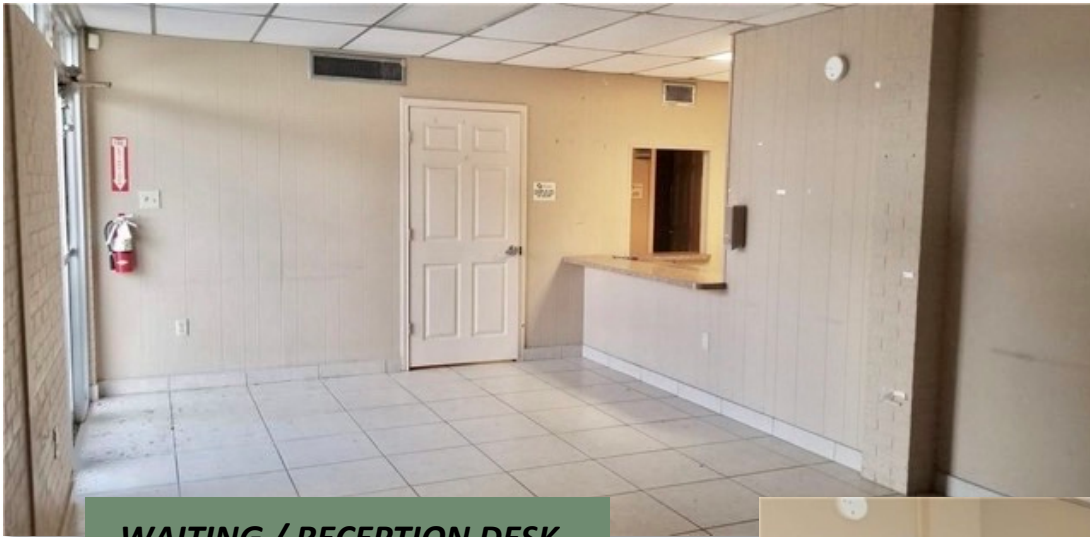
WAITING / RECEPTION DESK