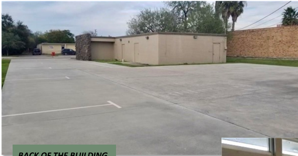
BACK OF THE BUILDING