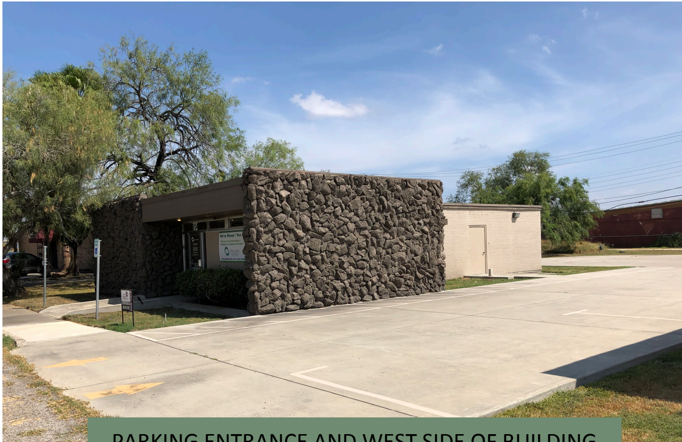
PARKING ENTRANCE AND WEST SIDE OF BUILDING