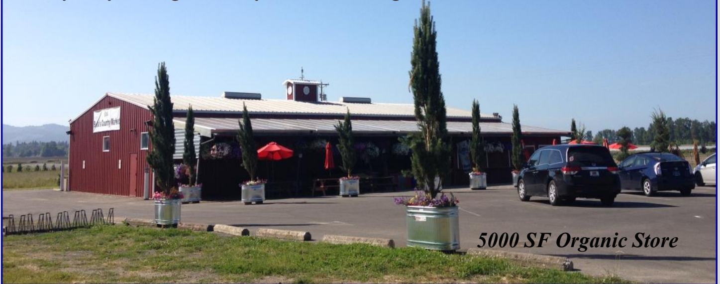
5000 SF Organic Store