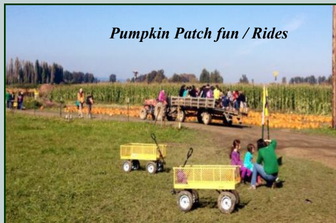
Pumpkin Patch fun / Rides