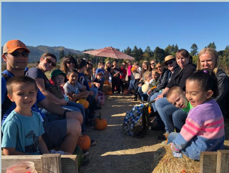
Farm Gatherings / Dinners