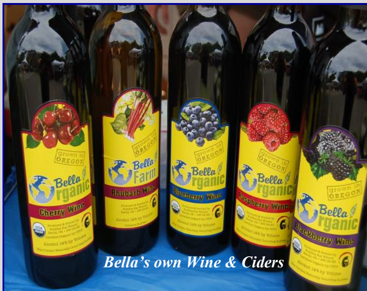
Bella's own Wine & Ciders