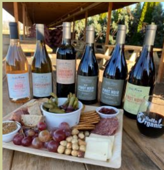
Farm Store Market