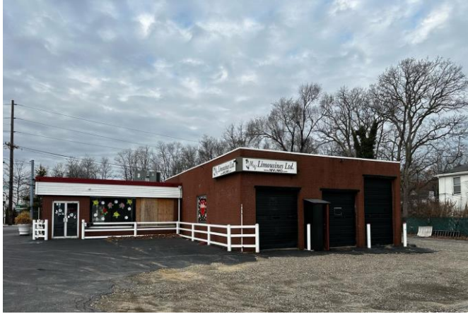
DRIVE-IN BAYS · Rear of Property

683 Middle Country Road · Saint James, NY