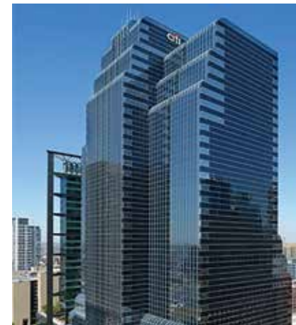
500 West Madison Chicago, Illinois