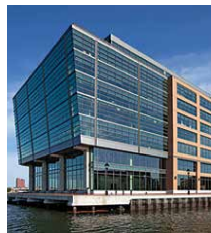
Thames Street Wharf Baltimore, Maryland