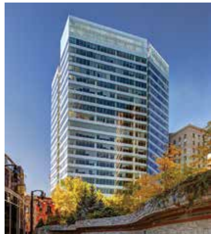
222 Main Salt Lake City, Utah

not only where you do business that matters, but how you do business. Our "hands-on" approach has led us to many successes, gaining us profound trust with our clients. At KBS, we believe our people are our greatest asset and our tireless efforts to conduct good business has not only earned us repeat investment opportunities, but also formed long lasting relationships.