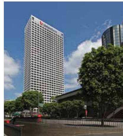
Union Bank Plaza Los Angeles, California