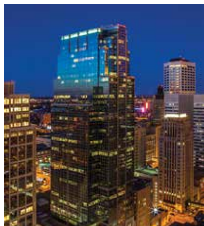
RBC Plaza Minneapolis, Minnesota