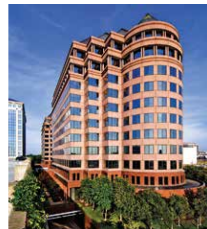
Providence Towers Dallas, Texas