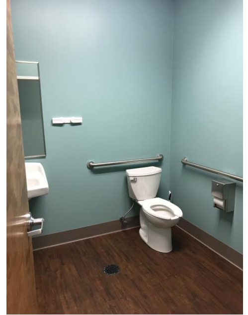
ADA Compliant Restroom (2)