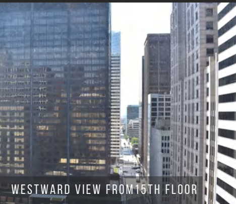
WESTWARD VIEW FROM 15TH FLOOR