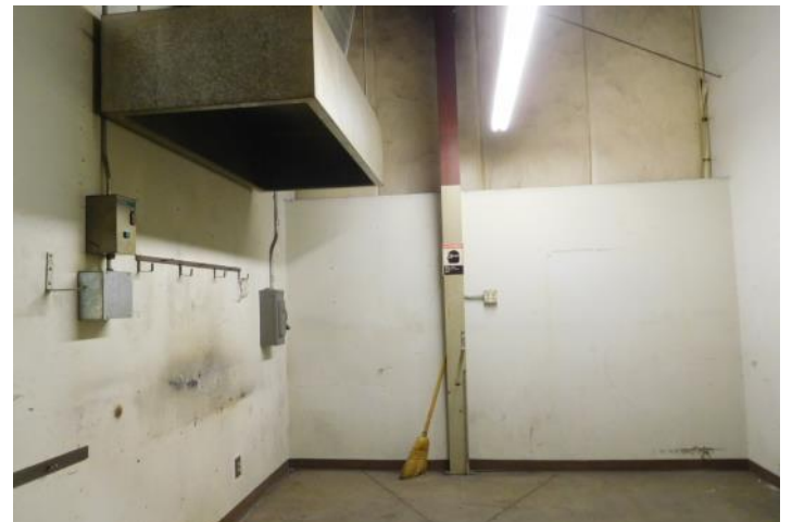
All materials furnished is from sources deemed reliable, but information has not been verified and is subject to errors or omissions