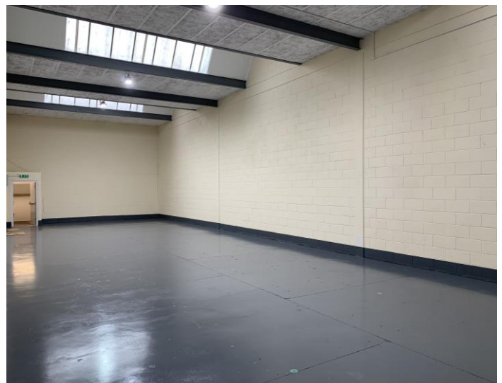
Indicative photo of internal