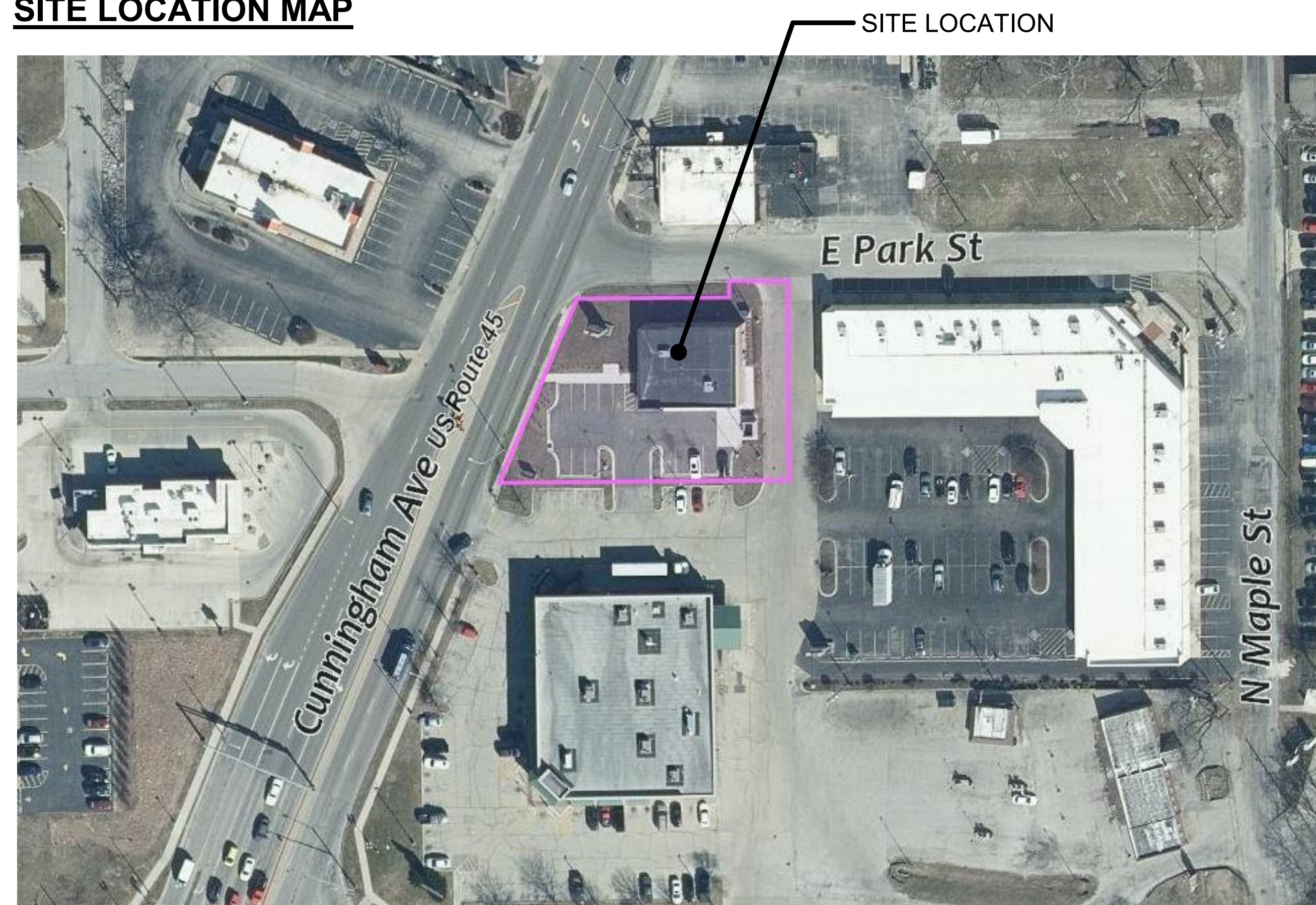
CHAMPAIGN COUNTY GIS 2020 AERIAL VIEW