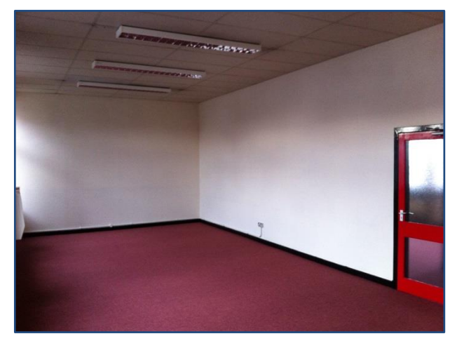
Current Availability Please refer to the attached Availability Schedule.