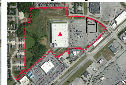
Overall Site (NTS)

Proposed Building & Parking (Conceptual)