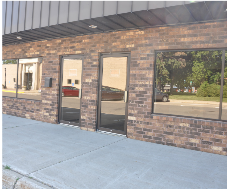
Vacant Space Entrance