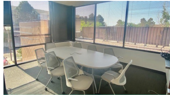
Small Conference Room