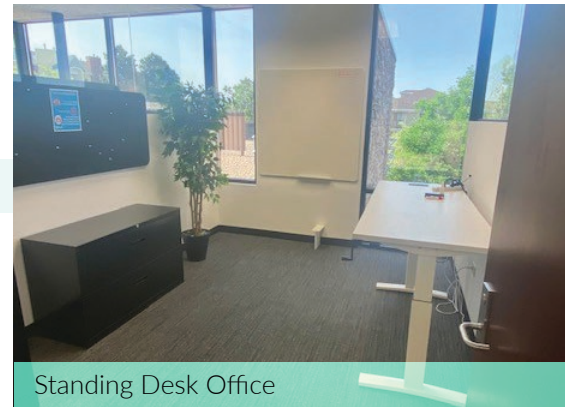
Standing Desk Office