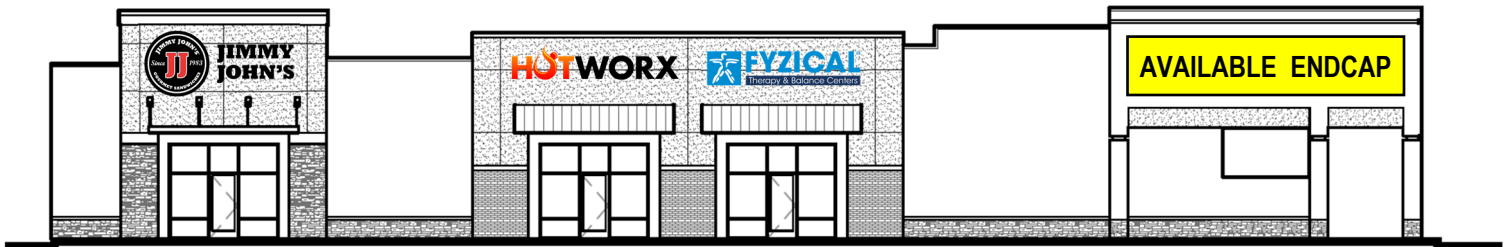
ROSE CREEK DRIVE ELEVATION