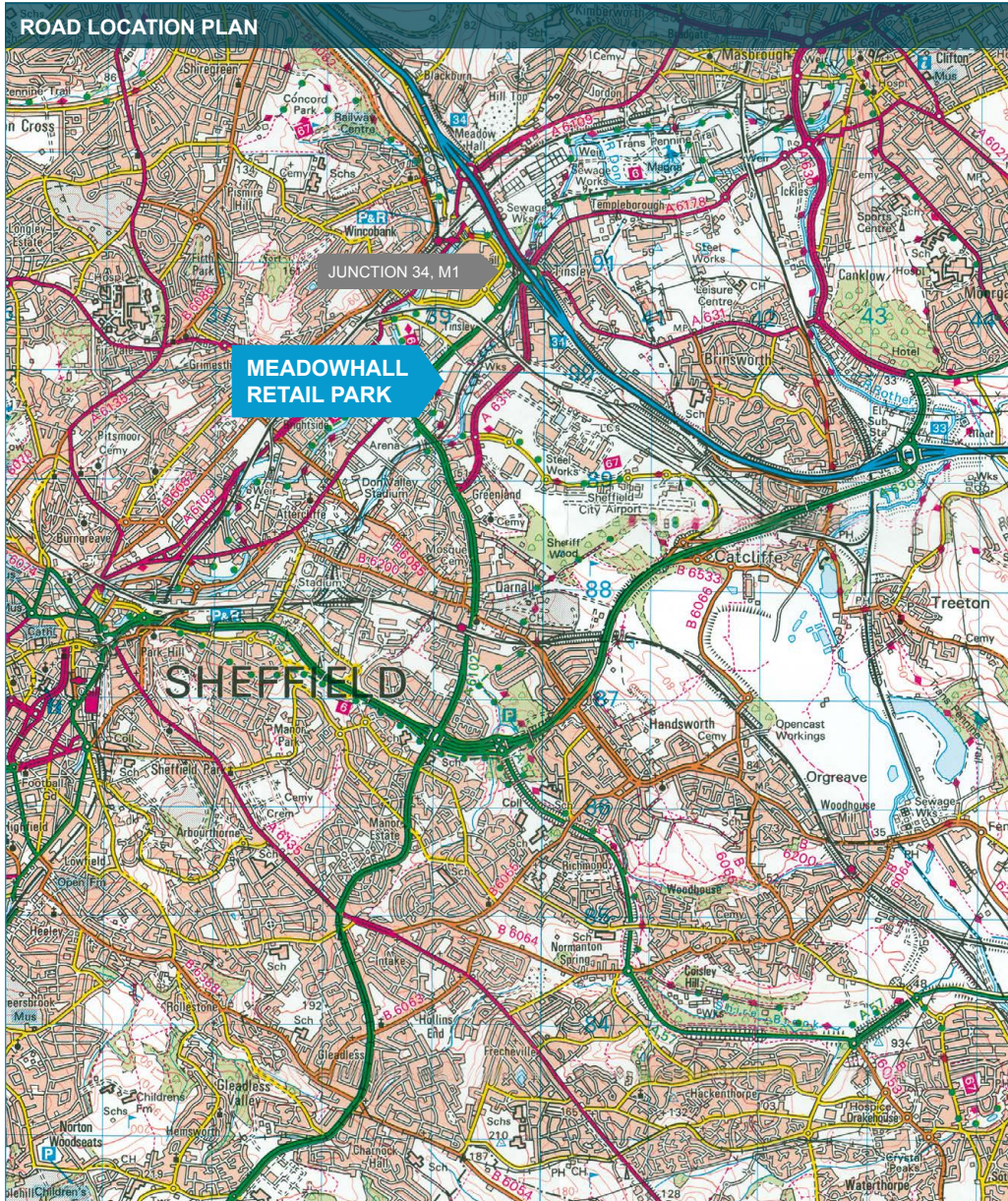
Extensive resident catchment population of 440,000 extending to 1.1 million within 20km