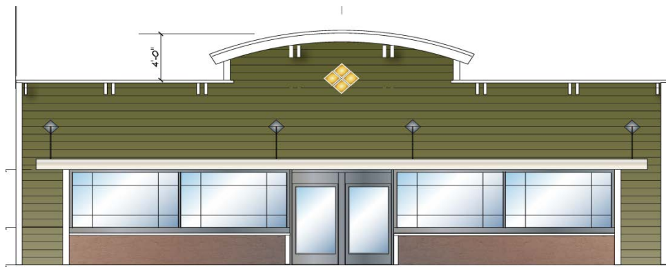
APPROVED Facade Remodel in the works