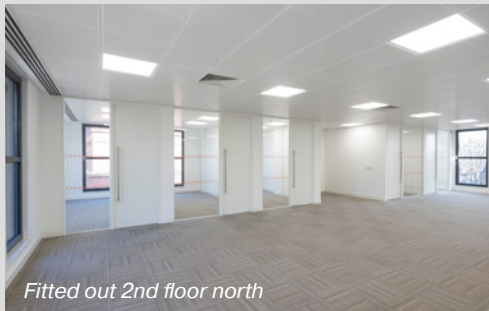
Fitted out 2nd floor north

The available space offers both refurbished fitted out and refurbished open plan Grade A office space offering flexible open plan accommodation with excellent natural light and ceiling height. There is an entrance from Auriol Road which leads to a secure underground car park along with bike storage and showers.