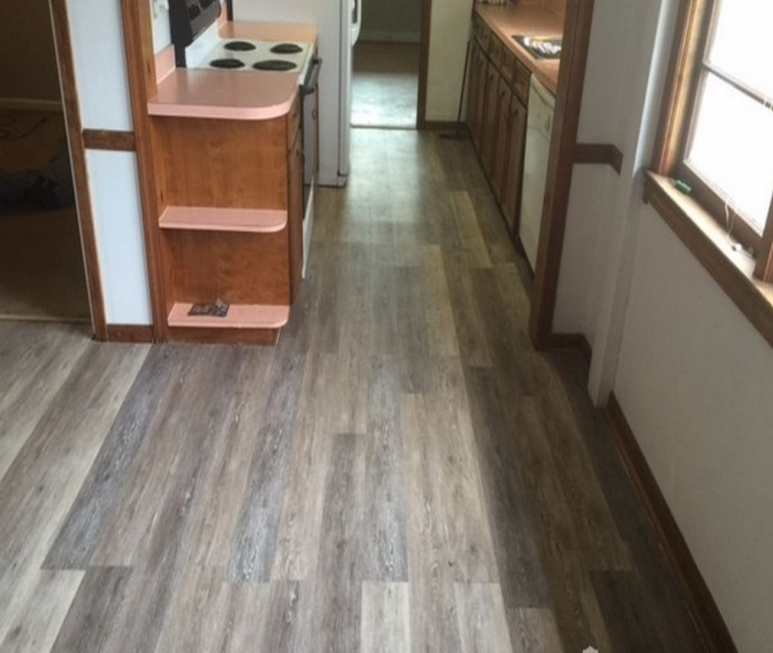
Barretts Way, Lexington, SC