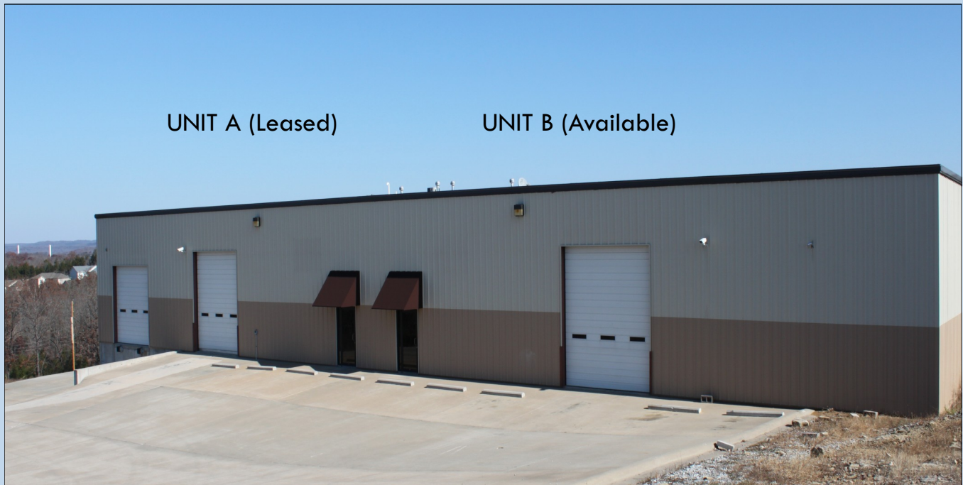
UNIT A (Leased)