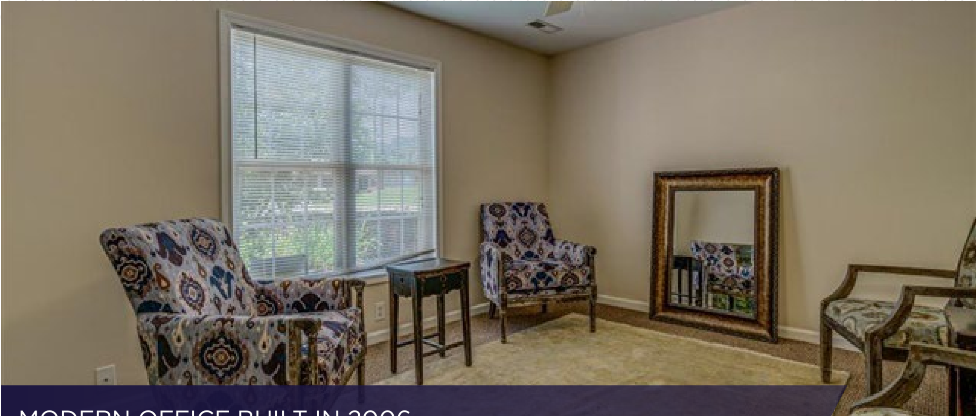
MODERN OFFICE BUILT IN 2006