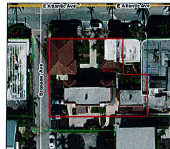
AERIAL PHOTOGRAPH (MAY NOT SHOW LATEST IMPROVEMENTS) (NOT-TO-SCALE)

BEARING REFERENCE: NONE. RECORD INFORMATION RELIANT UPON ANGULAR DATA ONLY. ALL ANGULAR DATA SHOWN HEREON REFERENCED THERETO.