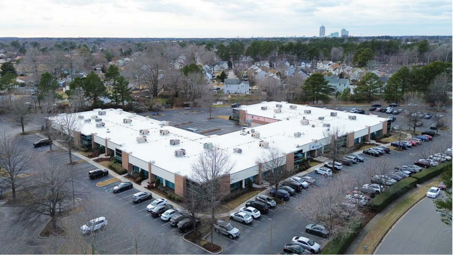
Rosemont Interstate Center II Virginia Beach, VA