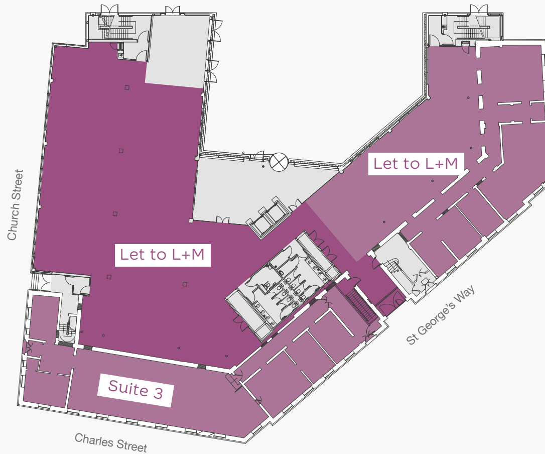
2 COLTON SQ GROUND FLOOR PLAN