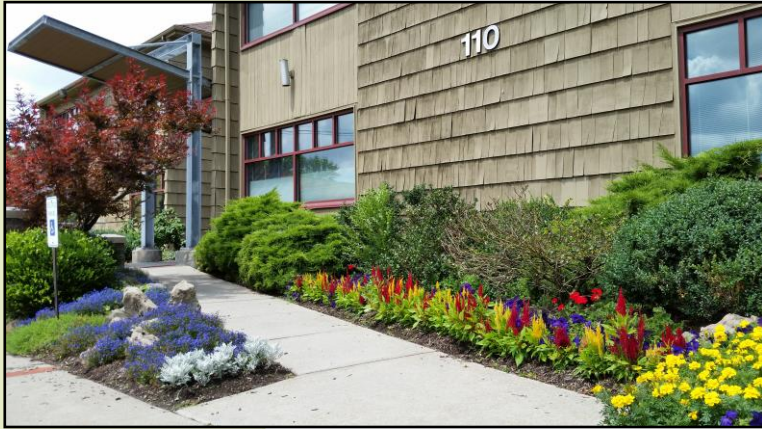
New Entrance Building 110