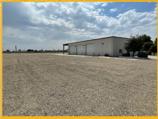
22356 Rosedale Highway