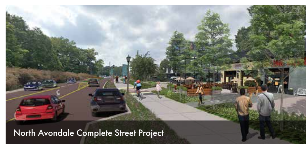
North Avondale Complete Street Project