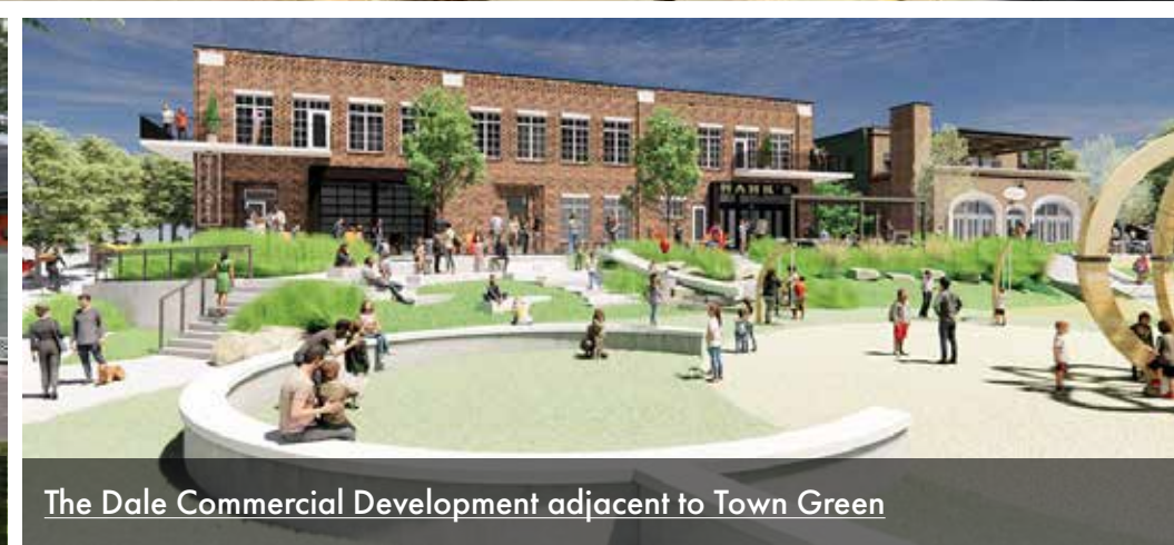
The Dale Commercial Development adjacent to Town Green