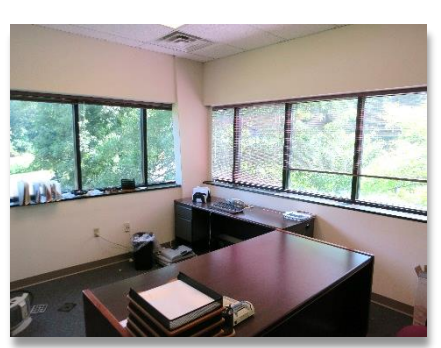
View of Typical Private Office