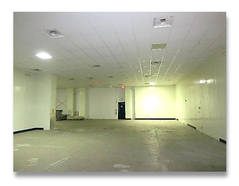
Air-Conditioned Production/Storage Area