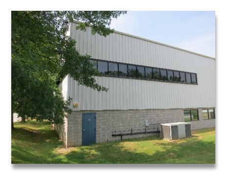
Exterior View of Office Area