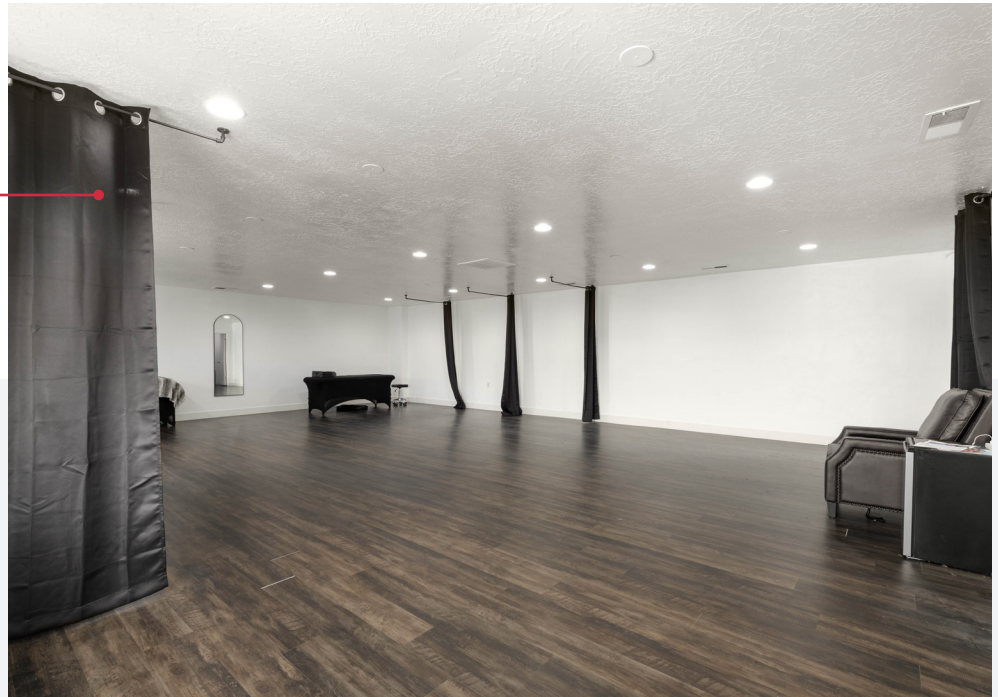
Retail Space on St George Blvd