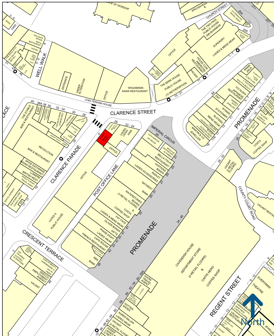
Experian Goad Plan Created: 24/05/2018 Created By: KBW Property