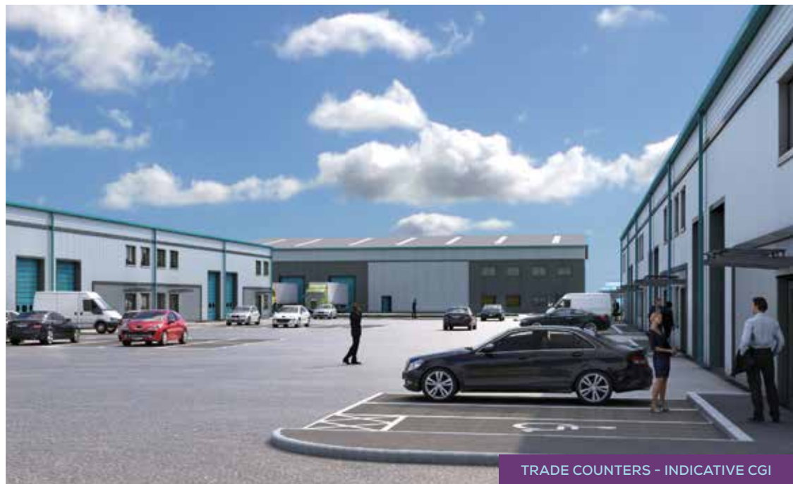
TRADE COUNTERS - INDICATIVE CGI