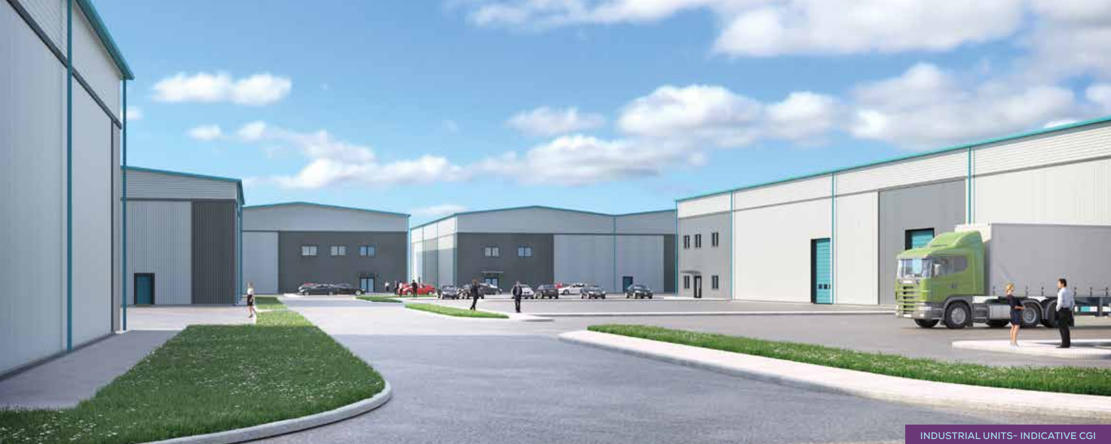
INDUSTRIAL UNITS- INDICATIVE CGI