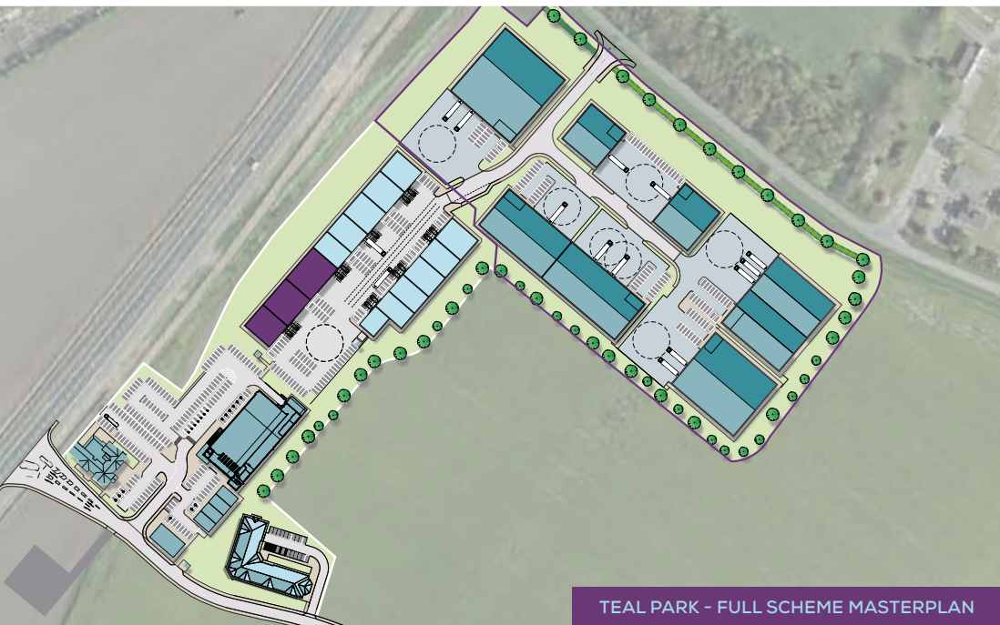
TEAL PARK - FULL SCHEME MASTERPLAN