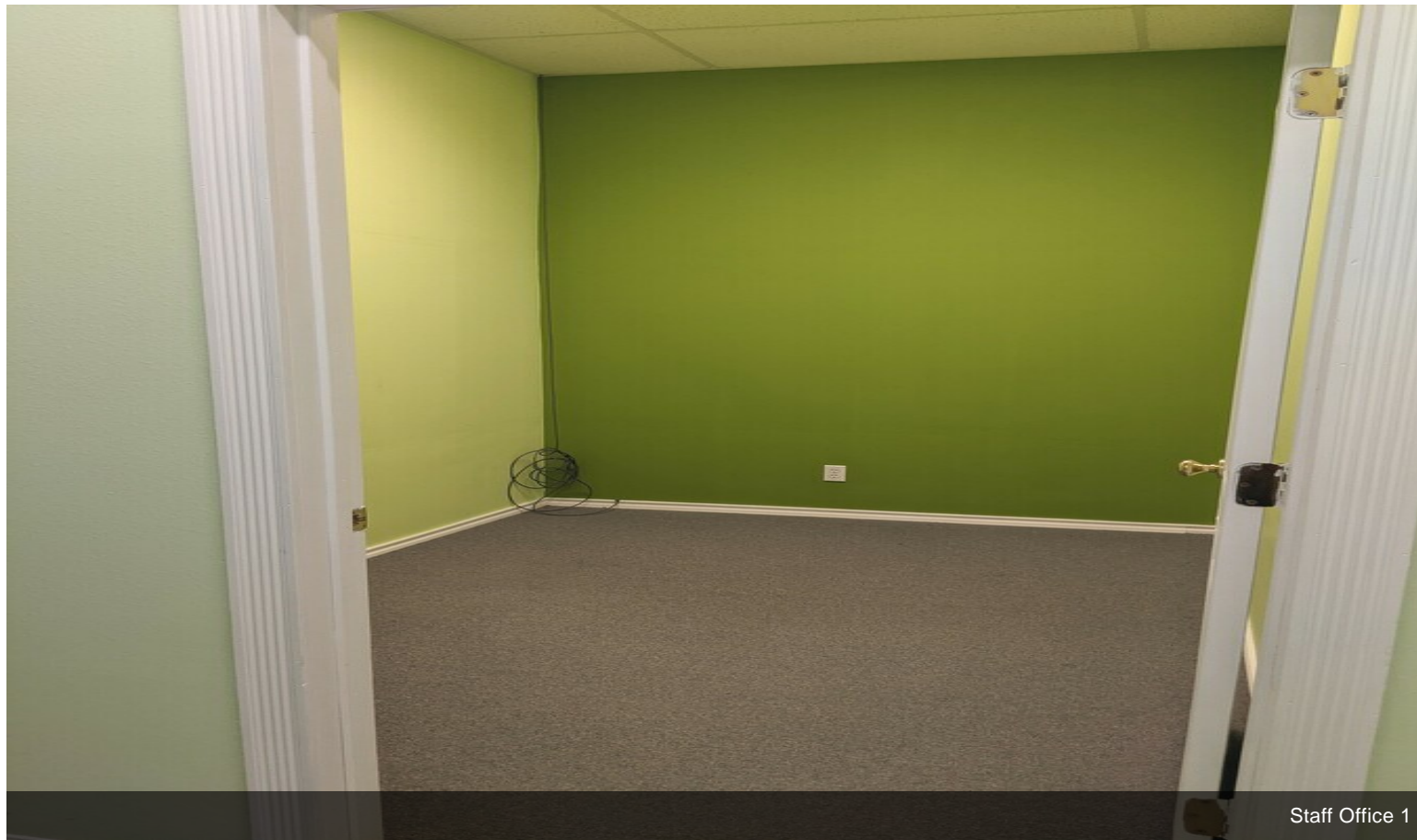
Staff Office 1