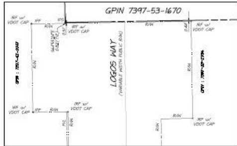
DETAIL 'A' NO SCALE