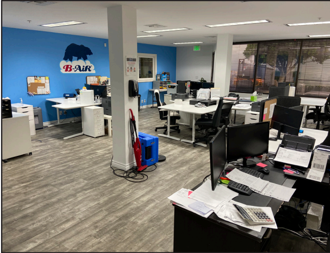
FLEXIBLE OPEN OFFICE FLOOR PLAN