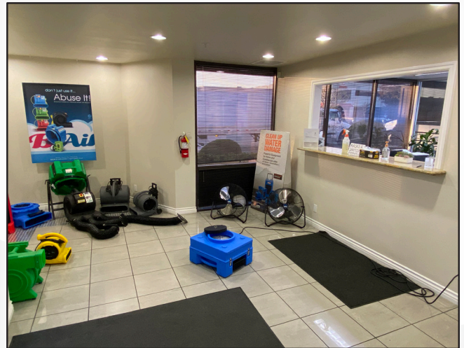
PROFESSIONAL FRONT LOBBY