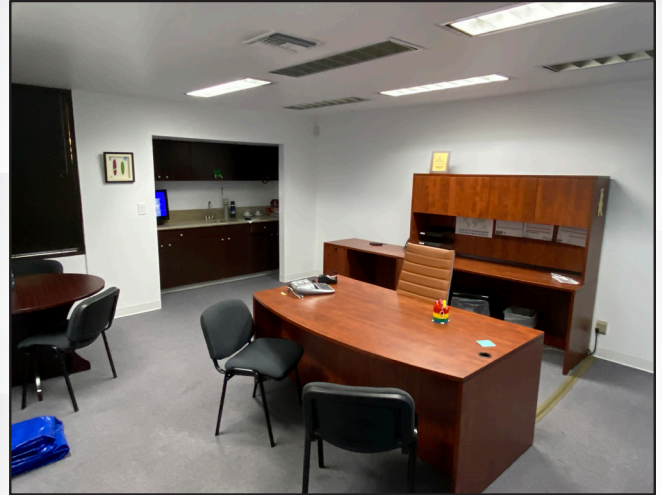
UPGRADED PRIVATE OFFICES