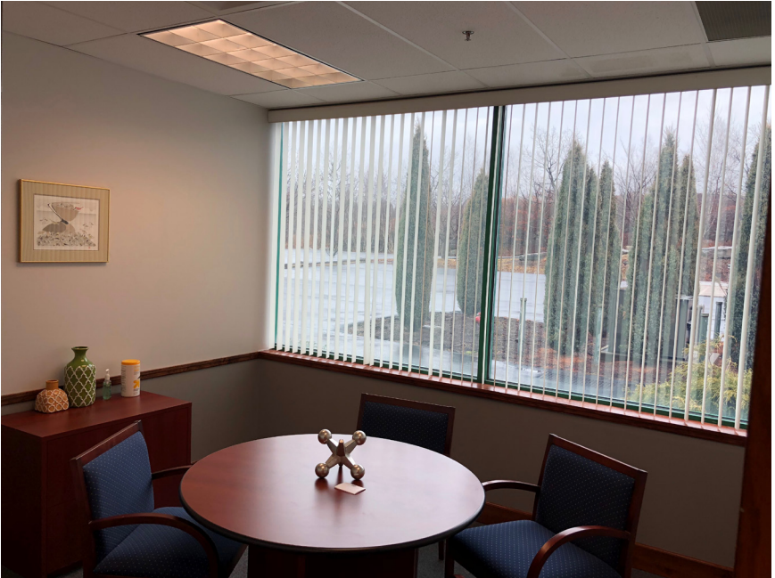
WINDOWED OFFICE #2