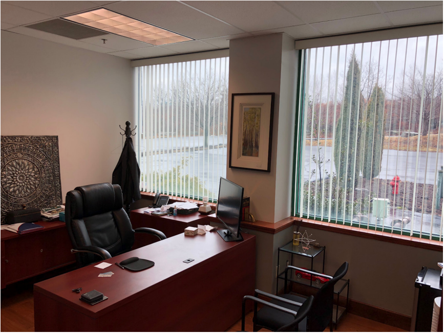
WINDOWED OFFICE #1