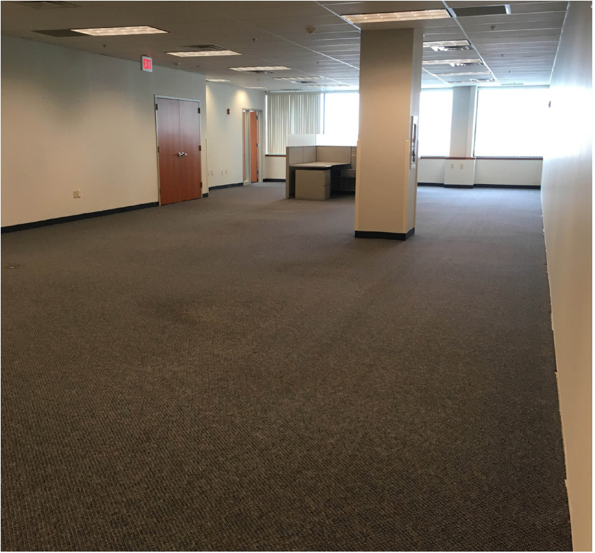
OPEN SPACE WITH PLENTIFUL NATURAL LIGHT