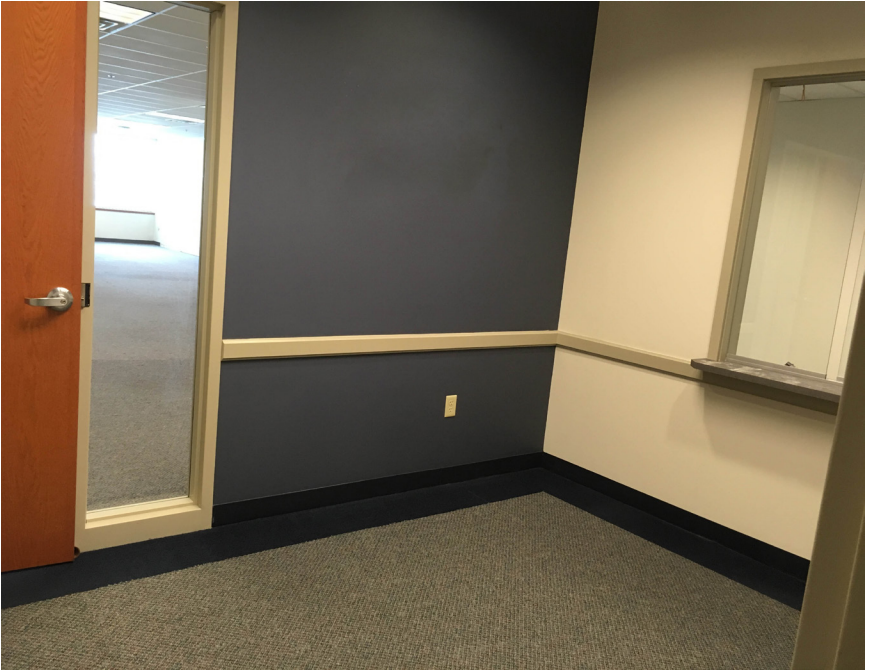
VESTIBULE WITH RECEPTION WINDOW