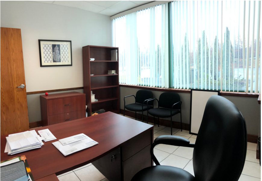
WINDOWED OFFICE #3