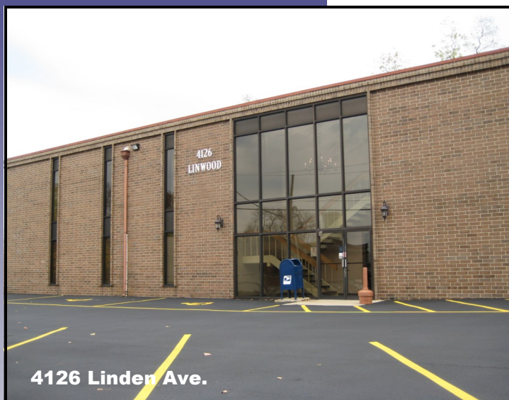
4126 Linden Ave.